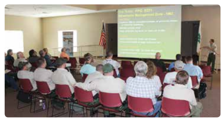
Attendees at the water quality workshop held in Kenansville, May 2017.