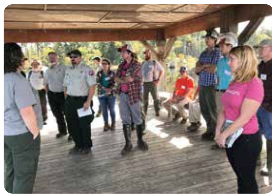
Four field tour stops and attendees at the Bottomland and Swamp Forests Symposium field tour, November 2017.